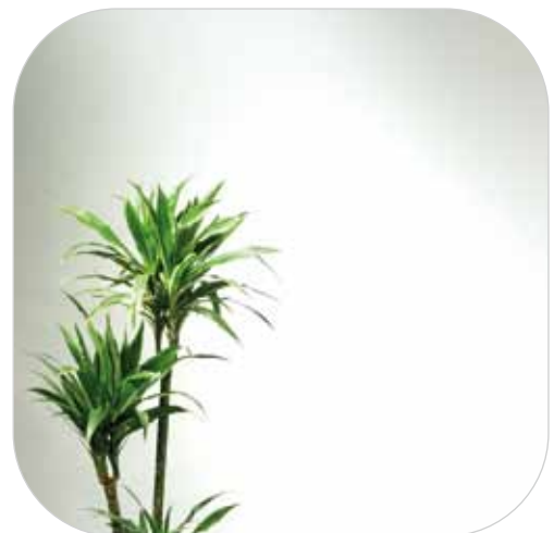
Pilkington Optimirror™ OW